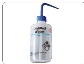
1 x spray bottle for DI-water