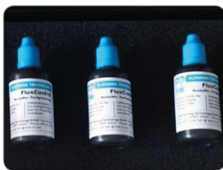
3 x 50 ml FluxControl